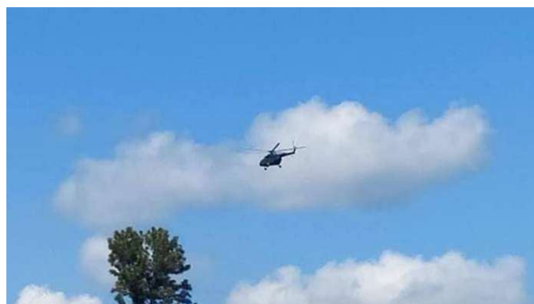
Burma Army helicopter flying over Ho Na village on August 18, 2019

11 am-12 pm: A helicopter was seen flying from Lashio to the north of Ho Na village. It dropped about ten bombs in the jungle about 500 meters north of Ho Na village. It then disappeared, and about ten minutes later a helicopter was again seen flying over the same place, dropping about ten bombs.