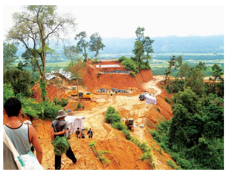
Loi Kham hills ravaged by gold mining in Tachileik district, E. Shan State