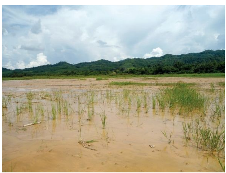
Paddy fields destroyed by gold mining waste near Na Hai Long village, Ta Ler, Tachileik district, E. Shan State