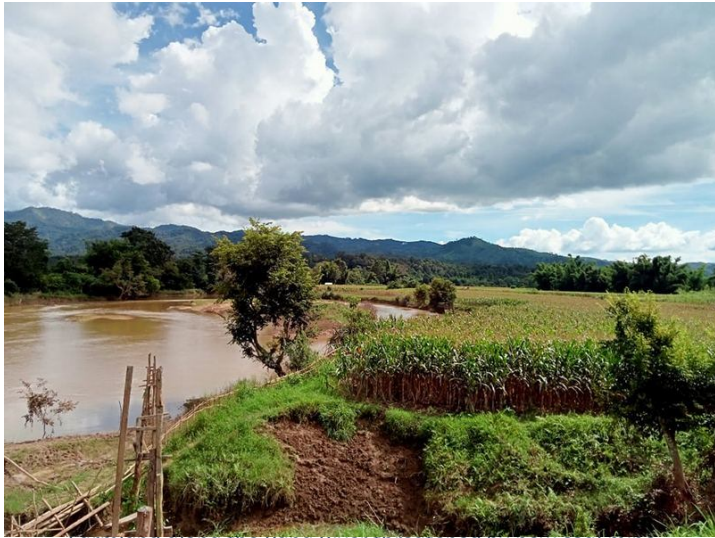
Farmlands along the Pang River threatened by new coal mine

sign, whatever they were offered. They said they relied on their farmlands for their livelihoods and no amount of money could provide for them throughout their lives like their lands.