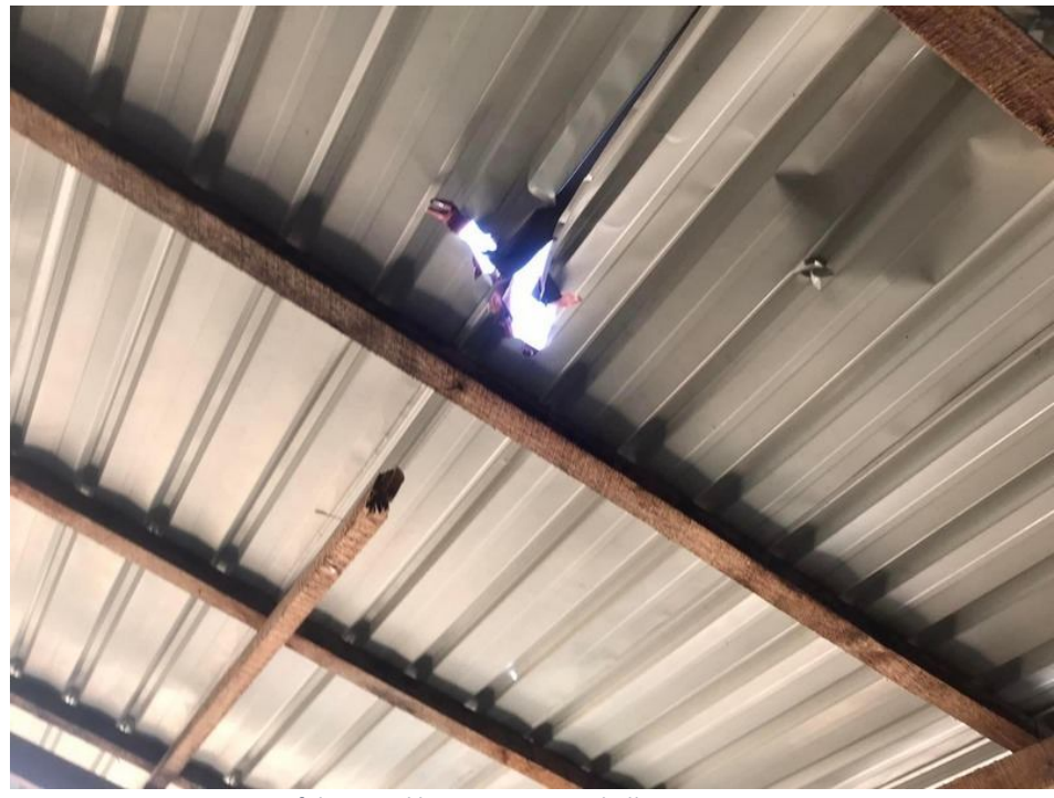
Roof damaged by Burma Army shelling in Koong Sar