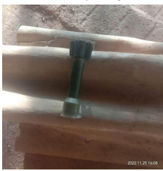
Unexploded Burma Army shells in Koong Sar village

Terrified by the fighting and shelling, about 700 villagers fled from their homes in Koong Sar and nearby villages. Some took shelter in village temples and churches, and some in temples in Hsipaw town.