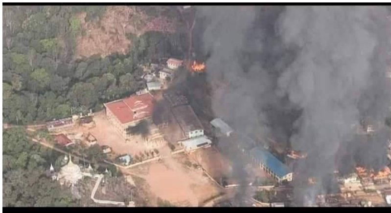
Houses burned by SAC troops in Nam Neang village

On March 11, in the morning, SAC soldiers at Payakone hill fired artillery indiscriminately and deployed more troops into Nam Neang village. Later that morning, SAC troops from ID 66 and LIB 518 called out 3 monks and 18 local villagers who were taking refuge in the Nam Neang temple building and shot them dead. After killing them, the SAC troops took photos of the corpses and shared the photos on social media, saying they had killed PDF forces.