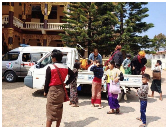
Residents of Nam Naeng and nearby villages fleeing attacks and taking shelter at a temple in Pinlaung town