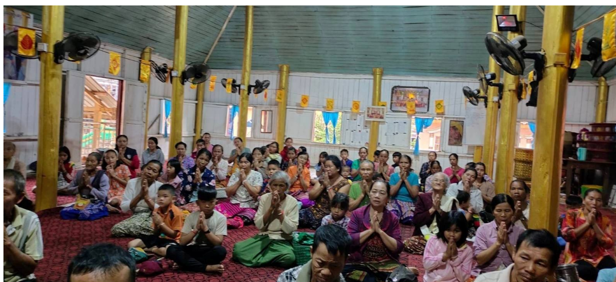
IDPs taking refuge at Ho Mong Temple

Apart from this, several hundred villagers took refuge in other locations: Pang Na villagers fled to Jay Oo temple; Koong Nyaung villagers fled to stay with their relatives in Lashio, Kunlong and Ho Pang; while Kawng Khio villagers and some Phai Kham villagers fled to Phai Kham temple.