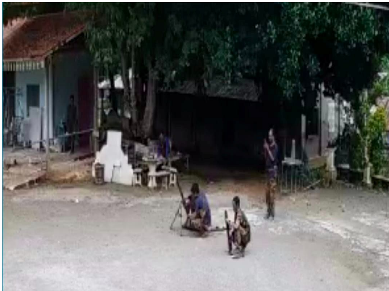
SAC troops in Koon Kawk temple compound

On October 10, from 1:30 pm to 2 pm, SAC troops encamped in Koon Kawk temple compound fired shells into the surrounding hills where KIA troops were staying.