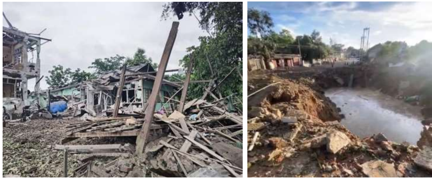
School building destroyed by SAC airstrike

On July 25, an aerial bomb left a huge crater in Quarter 2 of the town, damaging ten houses. The size of the crater appeared to be larger than that of a 500 pound bomb.